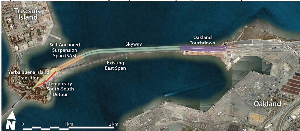
Figure 1. San Francisco-Oakland Bay Bridge Seismic Safety Project Location Map

The U.S. Fish and Wildlife Service (USFWS) Biological Opinion (page 22) and the California Department of Fish and Game (CDFG) Incidental Take Permit (Fully Protected Species Items 1 and 2 on pages 4 and 5) require monitoring of the California least tern and California brown pelican. The CDFG is also concerned about potential impacts to the American peregrine falcon and the double-crested cormorant and required a management plan for these species (Fully Protected Species Item 3