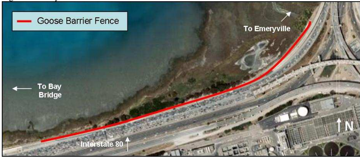
Figure 3. Emeryville Crescent Goose Exclusion Fence

This memo summarizes the SFOBB project bird monitoring activities conducted by LSA Associates, Inc. (LSA) and Garcia and Associates (GANDA) during the week of September 28 - October 2, 2009.