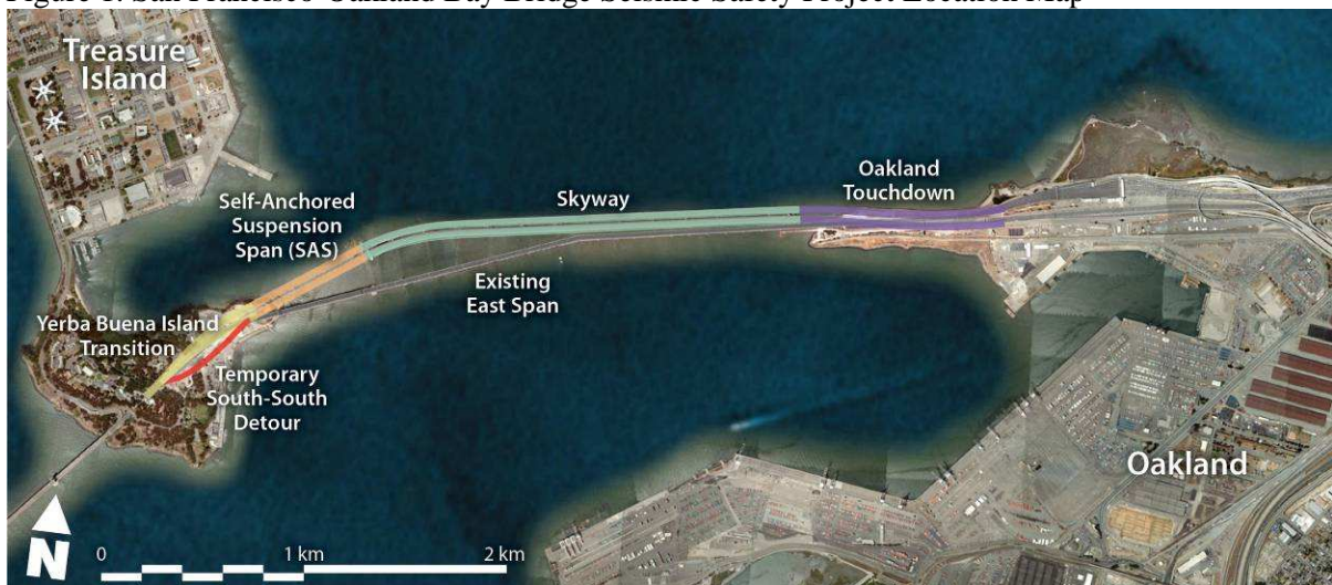
Figure 1. San Francisco-Oakland Bay Bridge Seismic Safety Project Location Map

The California Department of Transportation (Department) is in the process of replacing the East Span of the San Francisco-Oakland Bay Bridge (SFOBB) with a new bridge immediately to the north of the existing span (Figure 1). Construction of the San Francisco-Oakland Bay Bridge East Span Seismic Safety Project (SFOBB Project) is a multi-year effort that will involve a number of construction activities on land as well as in San Francisco Bay. Some of these activities could potentially affect federally and State endangered or threatened bird species and other bird species of special concern.