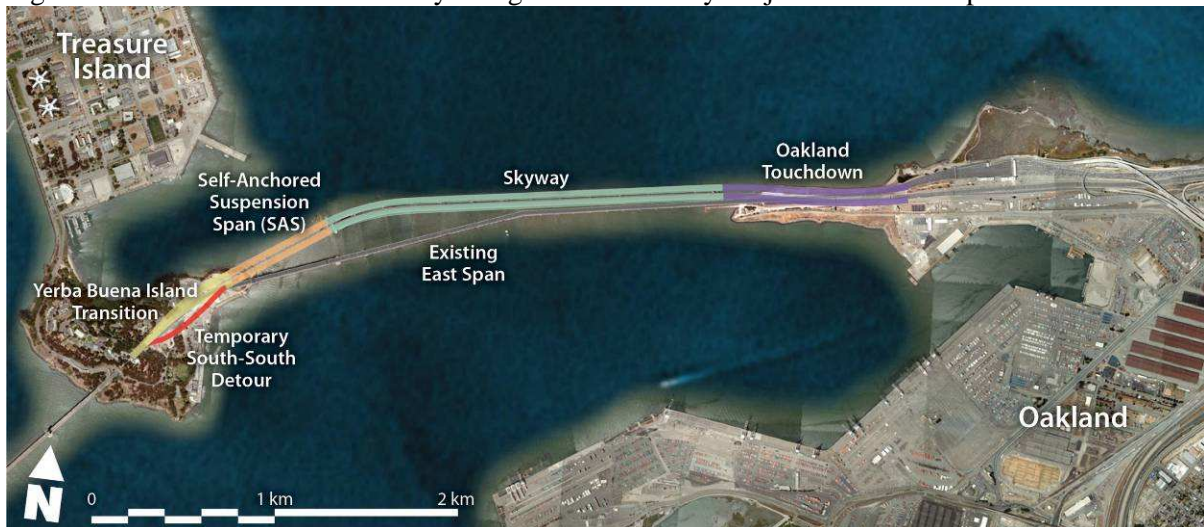
Figure 1. San Francisco-Oakland Bay Bridge Seismic Safety Project Location Map

The California Department of Transportation (Department) is in the process of replacing the East Span of the San Francisco-Oakland Bay Bridge (SFOBB) with a new bridge immediately to the north of the existing span (Figure 1). Construction of the San Francisco-Oakland Bay Bridge East Span Seismic Safety Project (SFOBB Project) is a multi-year effort that will involve a number of construction activities on land as well as in San Francisco Bay. Some of these activities could potentially affect federally and State endangered or threatened bird species and other bird species of special concern.