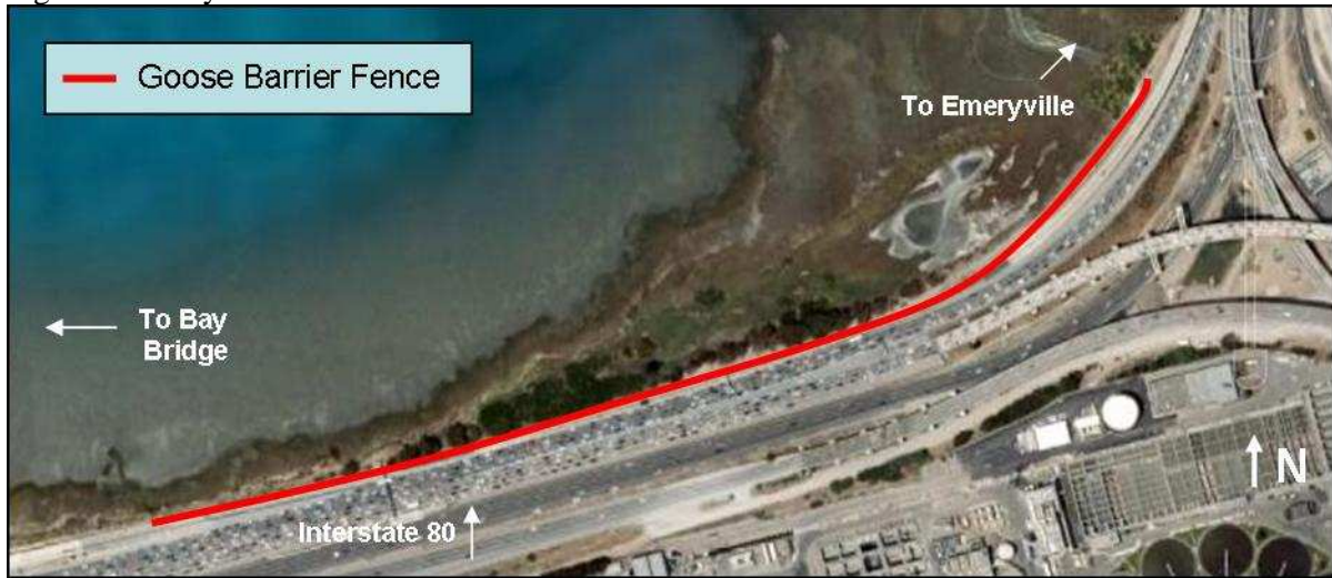
Figure 3. Emeryville Crescent Goose Exclusion Fence

This memo summarizes the SFOBB project bird monitoring activities conducted by LSA Associates, Inc. (LSA) and Garcia and Associates (GANDA) during the week of September 14 – 18, 2009.