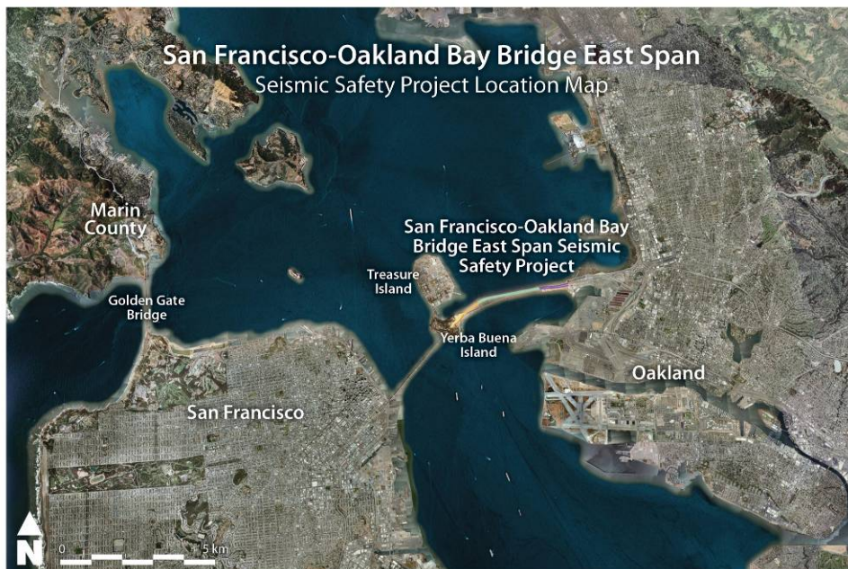
Figure 1: SFOBB East Span Seismic Safety Project Location Map

The California Department of Transportation (Department) is in the process of replacing the East Span of the San Francisco-Oakland Bay Bridge (SFOBB) with a new bridge immediately to the north of the existing span (Figure 1). Construction of the San Francisco-Oakland Bay Bridge East Span Seismic Safety Project (SFOBB Project) is a multi-year effort that will involve a number of construction activities on land as well as in San Francisco Bay. As part of the construction for the Self-Anchored Suspension (SAS) portion of the project, it is necessary to build temporary towers. These temporary towers, Temporary Towers D, F and G are marine based and require driving of temporary piles to support the SAS portion of the bridge during construction (Figure 2).