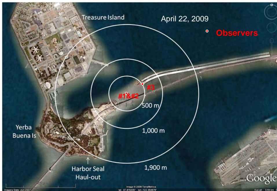
Figure 4: SAS temporary tower project area with 500 meter (preliminary), 1,000 meter (160 dB impact), and 1,900 meter (120 dB vibratory) MMSZs and marine mammal monitor observation sites for April 22, 2009.

On April 22, 2009: Observers #1 and #2 were located on the pile driving barge at Temporary Tower G and Observer #3 was on the western end of the new Bay Bridge, as shown on Figure 4. Pile driving was conducted on four piles from 0846 to 1032 hours using the diesel impact hammer. Observations were made from 0730 to 1120 hours.