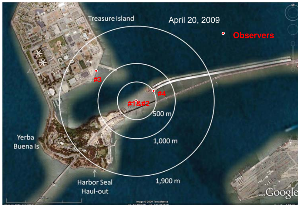
Figure 3: SAS temporary tower project area with 500 meter (preliminary), 1,000 meter (160 dB impact), and 1,900 meter (120 dB vibratory) MMSZs and marine mammal monitor observation sites for April 20, 2009.

On April 20, 2009: Observer #1 and Observer #2 were located on the pile driving barge at Temporary Tower G, Observer #3 was located on the southeast end of Treasure Island, and Observer #4 was on the western end of the new Bay Bridge, as shown on Figure 3. Pile driving was conducted on four piles from 1402 to 1525 hours using the vibratory pile driver. Observations were made from 1300 to 1610 hours.